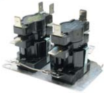
Sequencers (Double Flush Mount Plate w/Mounting Hole and Tab)